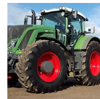
Millard Ag Contracting